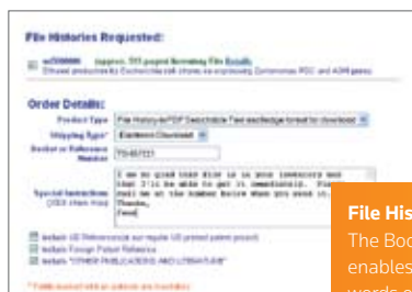
File History Ordering The Boolean text search enables you to search by words or phrases using up to four designated patent fields.

The Integrated View features a direct link to the patent document's corresponding DWPI record—as well as a link to order a file history and a link to display Corporate Tree hierarchy data for the Assignees. The Family Legal Status report is accessed from the Integrated View and shows legal status information for all members of the patent family.