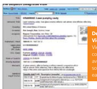
Delphion Integrated View The Delphion Integrated View gives you the most complete patent record available. Data from multiple sources come together in one easy-to-scan view.